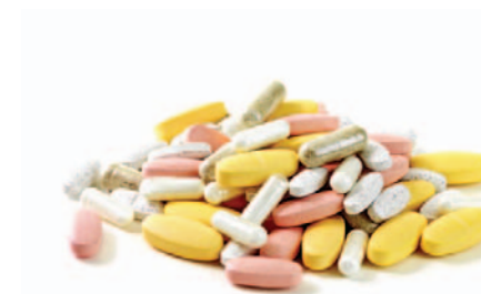
Vitamin supplements are used to make up for vitamins that the diet lacks.

Sometimes high levels of fat build up in the blood, especially if a child has an inborn defect in his ability to process fat. This possibility can lead to serious effects, which is another reason for careful monitoring by the healthcare team.