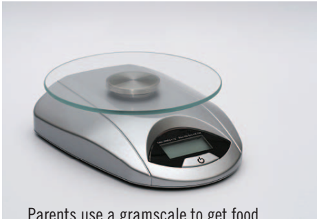
Parents use a gramscale to get food amounts exactly right.

Meal plans combine small amounts of fruits or vegetables (carbohydrates), meat, fish or chicken (protein), lots and lots of fat (often in the form of cream, butter, eggs, or mayonnaise) and no sugar.