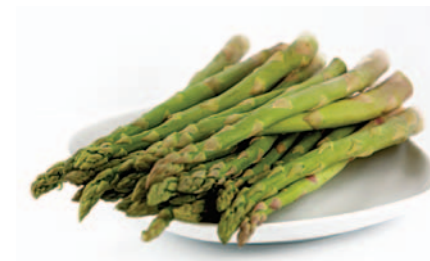
Small amounts of food look bigger on a small plate.

If the seizures return, the doctors may recommend putting the child back on the diet.