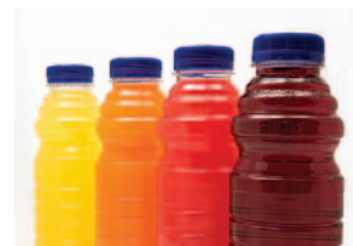
Artificially sweetened drinks may be substituted for regular drinks.

“My son was too sleepy on his medicines. He continued to average about 20 seizures a month while on medication. He was not a candidate for surgery because his seizures came from the speech area of his brain. So we tried the diet. He showed real willpower to follow the diet.”